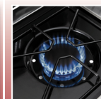
Powerful Cast Iron Side Burner