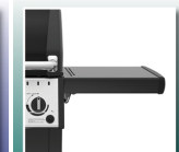
Stylish Steel Side Shelves