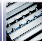
Stainless Steel Flav-R-Wave™ Cooking System