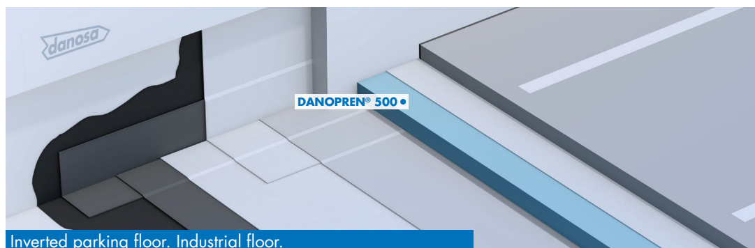
Inverted parking floor. Industrial floor.