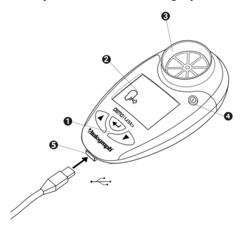
Figure 1 Vitalograph asma-1 USB Components