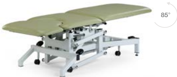
Minimum height with optional seat extension