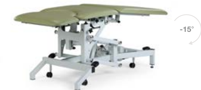
Backrest angle at -15° in recovery position