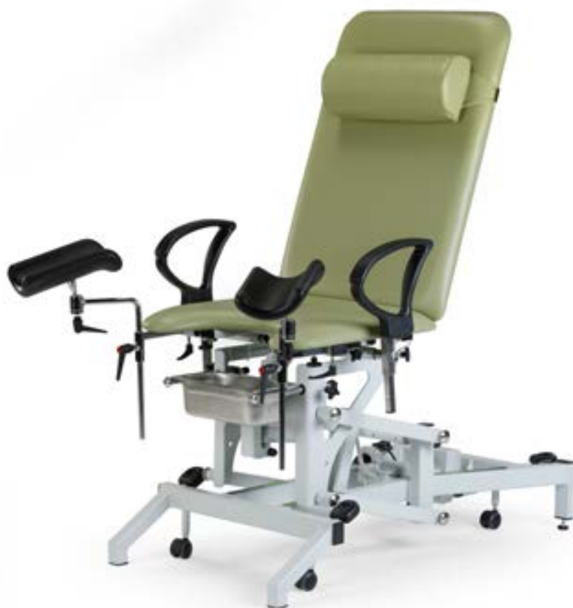
Model 93G1 Electric Colour - Wasabi

Designed to provide comfortable patient positioning for gynaecology procedures, the entry level G1 model is available with either electric or hydraulic height adjustment, and is supplied with leg supports, stainless steel debris tray, arm support loops and a matching D cushion for patient comfort. This model features a manually adjustable backrest and a seat section with cut-away design for gynaecology examinations. The backrest fully supports the patient in sitting and can be quickly lowered to provide a patient recovery position if required. A seat extension can be added as an option to fully support the patient in supine or prone lying.