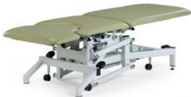
Minimum height with optional seat extension