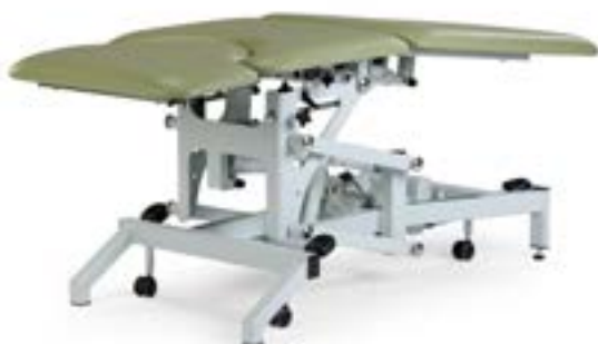
Backrest angle at -15° in recovery position