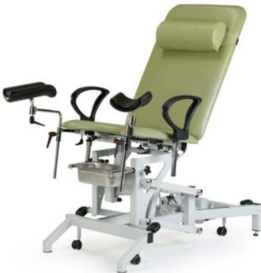
Model 93G3 Electric Colour - Wasabi

Designed to provide comfortable patient positioning for gynaecology procedures, the top of the range G3 model features electric height, backrest and Trendelenburg tilt adjustment and a seat with cut-away design for gynaecology procedures. This model is supplied with leg supports, stainless steel debris tray, arm support loops and a matching D cushion for patient comfort. The backrest fully supports the patient in sitting and can be quickly lowered to provide a patient recovery position if required. A seat extension can be added as an option to fully support the patient in supine or prone lying.