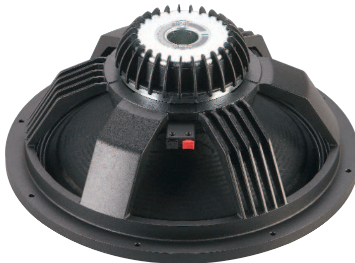
18LXN long-excursion low distortion loudspeaker

NOTES. 1.Frequency response: referred to 1 m; low end obtained through the use of near field techniques; one-third octave smoothed for correlation with human hearing.