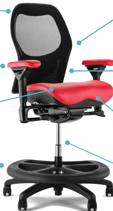
Shown as the R2608-WS2

The extra large (26") and wide (3") footring provides a secure surface at the exact height you need. Strengthened with glass-filled nylon resin, the base of the Sola Workstool also minimizes tipping hazards. At Stool height it provides support. At seated height it can be turned backwards to not obstruct ankles by swiveling the chair.