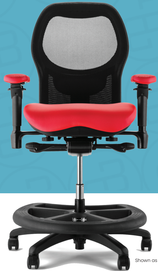
Shown as the R2608-WS2

Equally useful at desk height or stool height, the Sola Workstool is the perfect low-to-high workstool solution.