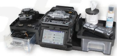
In Work Tray