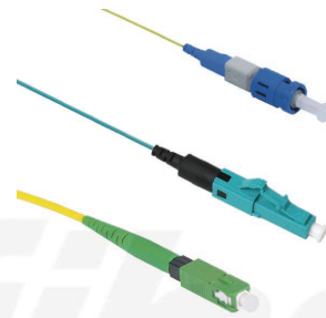
FUSEConnect Connectors (SC, LC, ST)