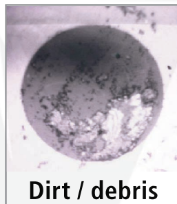
Dirt / debris