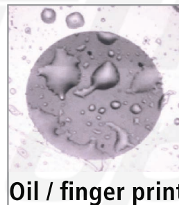
Oil / finger print