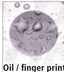
Oil / finger print