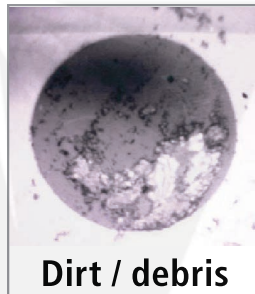
Dirt / debris