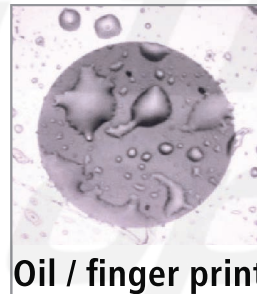
Oil / finger print