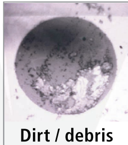
Dirt / debris