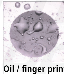
Oil / finger print