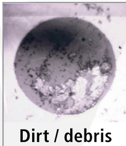
Dirt / debris