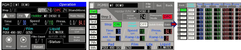
Interface of A3C model consumables info input & control