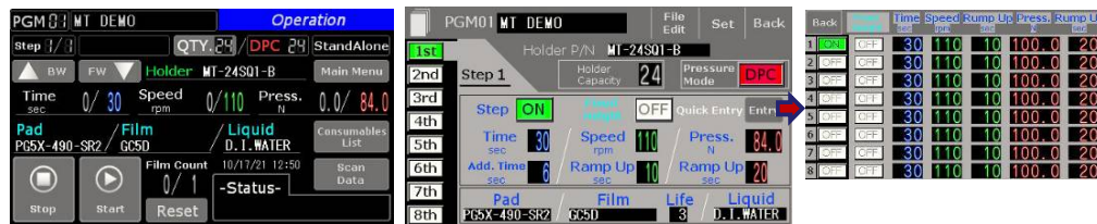
Interface of A3C model consumables info input & control