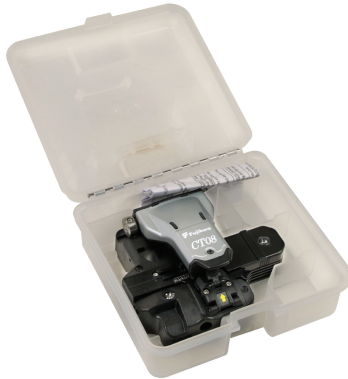
Shown in CC-34 Carrying Case