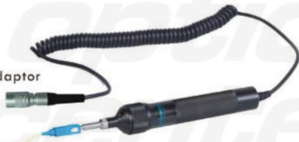
Durable Data Adaptor

Easyget uses aviation electrical plugs instead of USB connector compared to the previous version. The image of easyget will stay clean and stable even in the harsh environment.