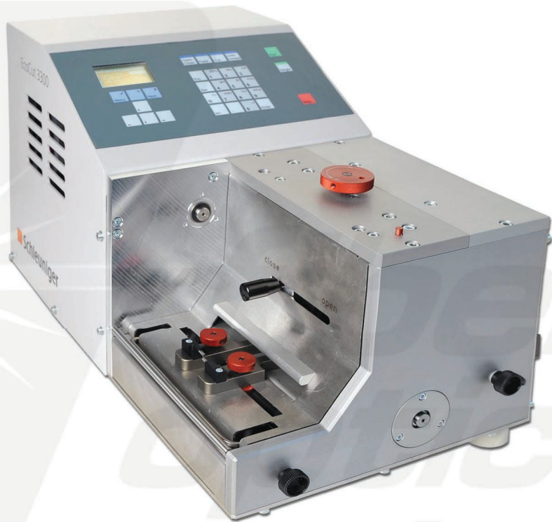
EcoCut 3300 Automatic Cutting Machine