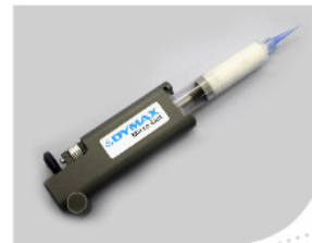
Thumb Activated Micro-Dot Syringe Dispenser (T20000)