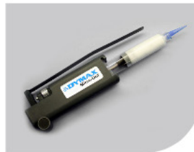
Lever Activated Micro-Dot Syringe Dispenser (T20010)

The Micro-Dot™ portable syringe dispenser offers positive-displacement accuracy for dispense volumes as small as 0.0003 mL. Once a volume is set it can be repeated with accuracy. This syringe dispenser utilizes a pre-packaged disposable syringe as its fluid reservoir, preventing any contact between the fluids and the dispenser eliminating fluid contamination during dispense. With the proper dispense tip selection, the Micro-Dot is suitable for dispensing a wide range of low-to-high viscosity fluids including pastes, lubricants, adhesives, sealants, and more.