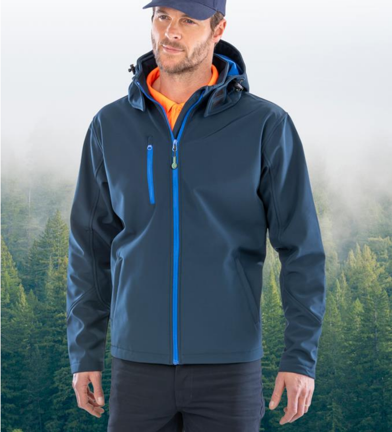
R230M MENS RECYCLED HOODED SOFTSHELL