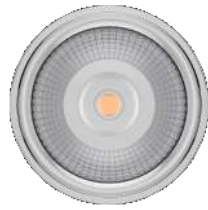
AR111 15° G53