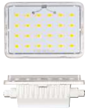
Lineal 9W R7S