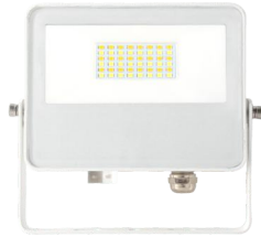
Sky 40W switch