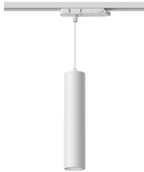
Atmos GU10 3PH suspension