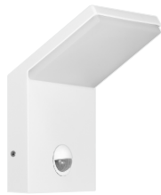
Neo XL sensor