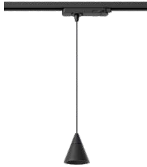
Zoe XL 3PH suspension