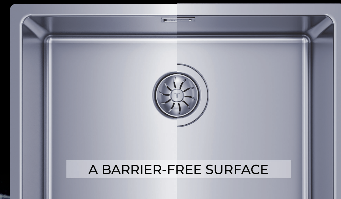
A BARRIER-FREE SURFACE

At Teka, we seek to offer a more sustainable product taking care of our planet with every step we take.