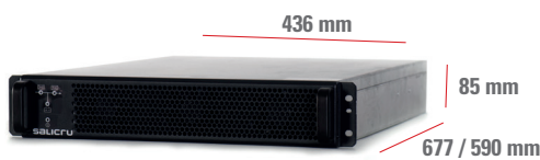
SLC ADAPT 10X÷25X