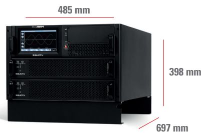
SLC-#/10-ADAPT 20X SLC-#/15-ADAPT 30X