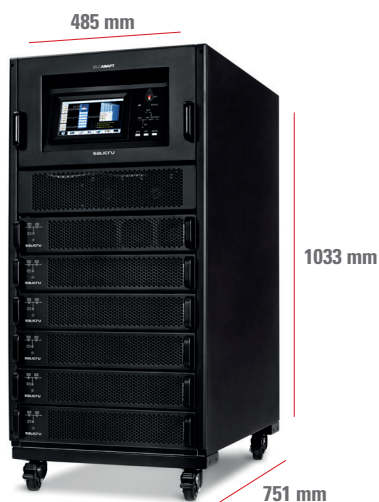
SLC-#/10-ADAPT 60X SLC-#/15-ADAPT 90X