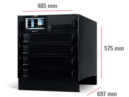
SLC-#/10-ADAPT 40X SLC-#/15-ADAPT 45X