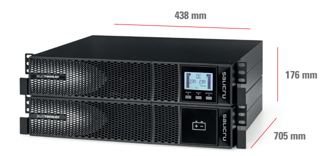
SLC 4000÷10000 TWIN RT2