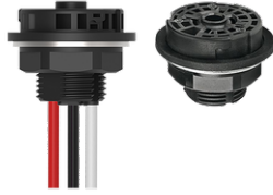
Zhaga Book 18 socket (Up) A90991-U