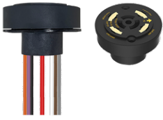
NEMA 7 socket A90891