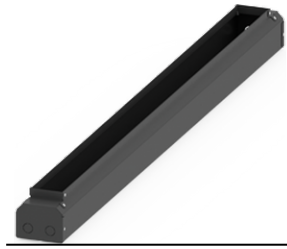
Recessing box A61051