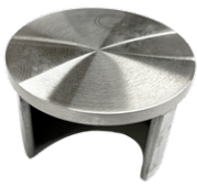
End cap for cap rail A30581