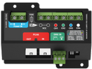
Constant voltage dimmer - 4 Channel A610291