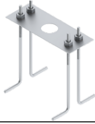
Anchor bolt A11191