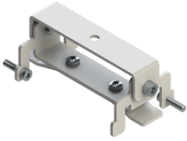
Ceiling-mounting bracket (60 mm profile) A81481