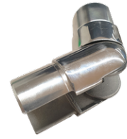
Connector for cap rail - Adjustable flush angle, 135° upwards A30381