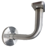
Wall bracket A30681