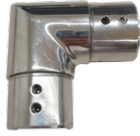
Connector for cap rail - Flush elbow 90° A30281