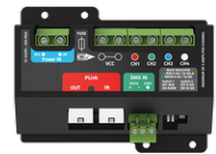
Constant voltage dimmer - 4 Channel A610291