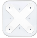
Xpress wireless switch A90591