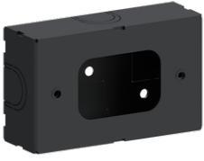
Surface mounting box for easy cabling (MATRIX 2) SCE-MATRIX-2