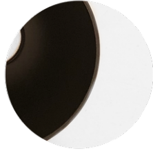
Reflector finish (Satin black) A80023-SB