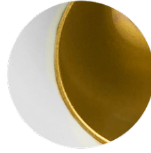
Reflector finish (Satin gold) A80023-SG