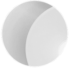
Reflector finish (Matt white) A80023-MW