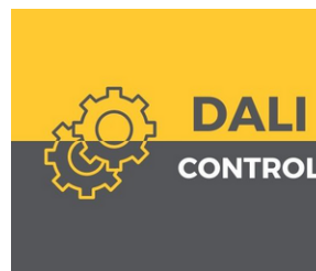
DALI Control System Control-DALI