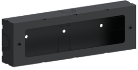
Surface mounting box for easy cabling (VEKTER 1) SCE-VEKTER-1