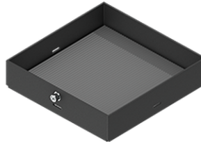
Linear spread lens A51314

Please contact the factory for technical details if you wish to use Anti-glare accessories, Colour filters, Lenses and slip glasses in combination.