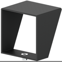
Anti-glare visor A53031