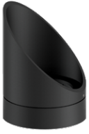
Anti glare visor A54431