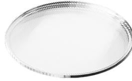
Linear spread lens A51814