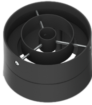
Anti glare louvre A54631