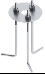
Anchor bolt A10791