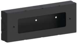
Surface mounting box for easy cabling (ABACUS 1) SCE-ABACUS-1