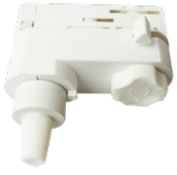
3 phase pendant adapter (Black) A80008