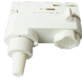
3 phase pendant adapter (White) A80007