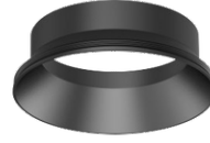
Anti-glare ring A80009