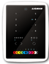
STICK-KE1, DMX Controller 1024 CH A60791