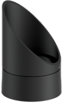
Anti glare visor A54331