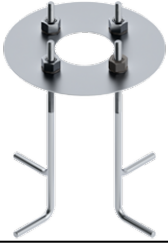
Anchor bolt A12191