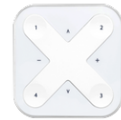
Xpress wireless switch A90591