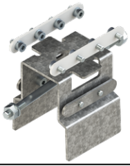
Continuous-coupler bracket A81781